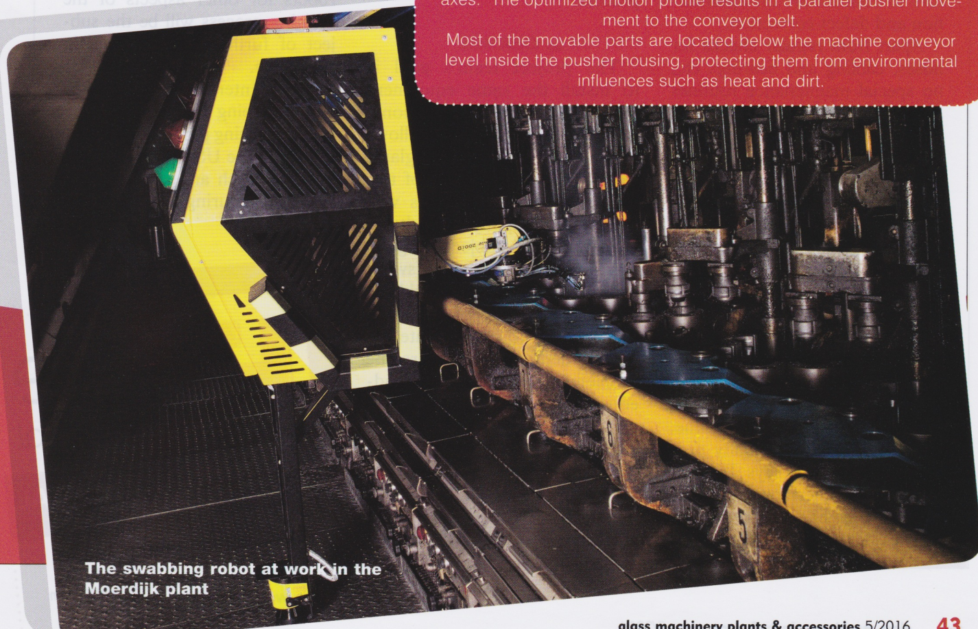
The swabbing robot at work in the Moerdijk plant

Most of the movable parts are located below the machine conveyor level inside the pusher housing, protecting them from environmental influences such as heat and dirt.